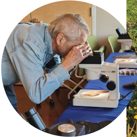
Top: A participant in an accessible birding event examines a feather under a microscope. Right: A group attending the event spots birds on Barker's Island in Superior, Wisconsin.