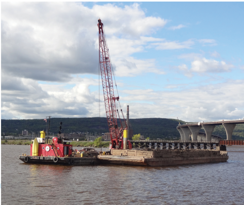
Dredge operating in the Duluth-Superior Harbor.