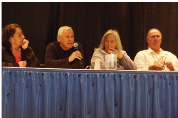
Native American elders discuss the cultural significance of wild rice during a panel presentation at the Second Annual Lake Superior Manoomin Restoration Workshop.