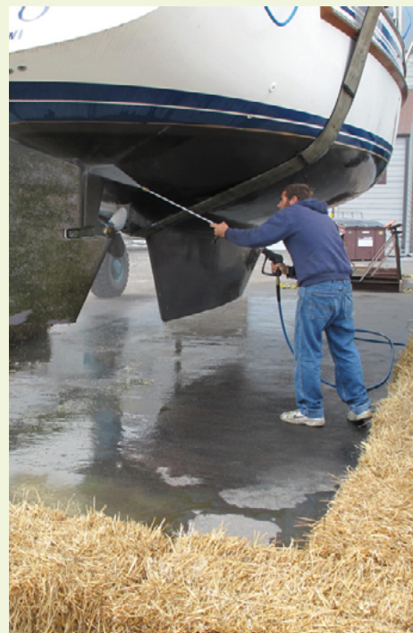
The Manitowoc Marina uses best-management cleaning practices to keep polluted water from running off into the harbor, which they learned through the Clean Marina Program.